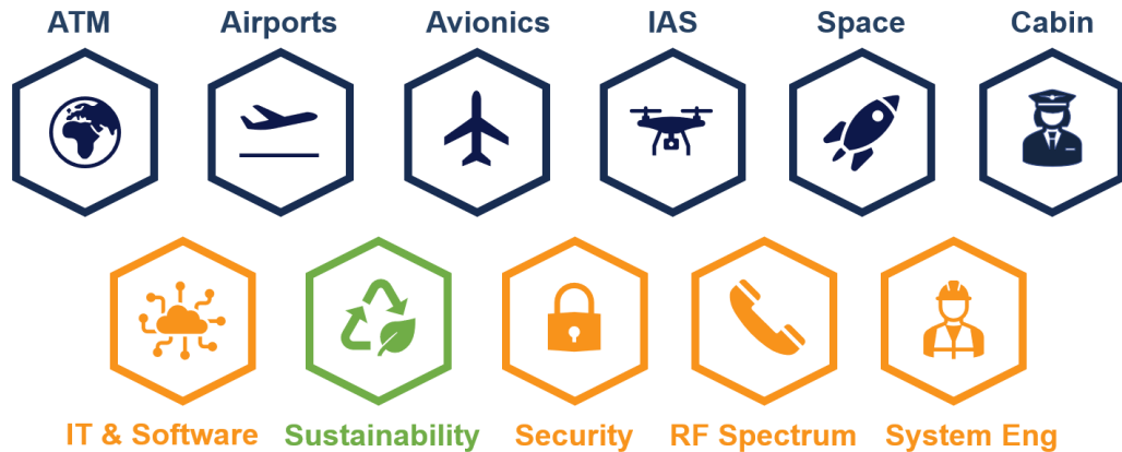
FIGURE 3: EUROCAE TECHNICAL DOMAINS

EUROCAE activities have been classified into the 11 domains, as per the following figure: