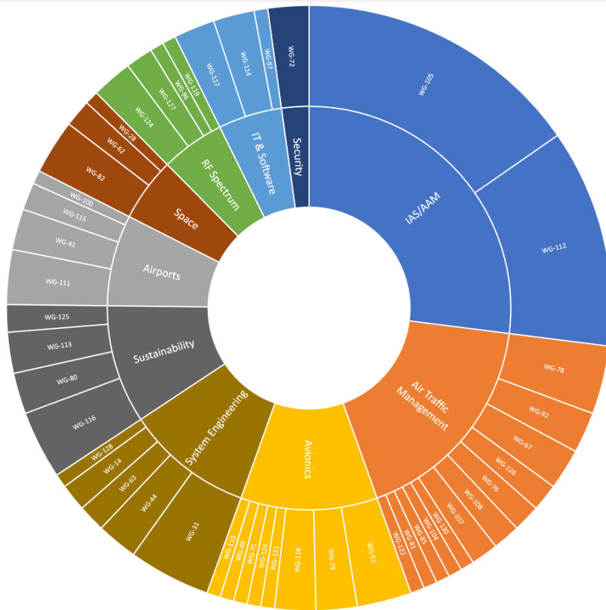
FIGURE 4: EUROCAE DOMAINS, BY NUMBER OF WG AND DOCUMENTS

Chapter 4 provided an overview of all the ongoing and foreseen activities across the 11 domains. It is important to note that some of these domains are likely to expand in the coming year. This is the case for activities related to Air Traffic Management where an important increase in activities related to ground certification (4.2) is expected. New WGs are also expected to be developed in the sustainability domain related to SAF or to address topics related to cabins. For visualisation of the domains by number of associated WGs and documents, see Figure 4.